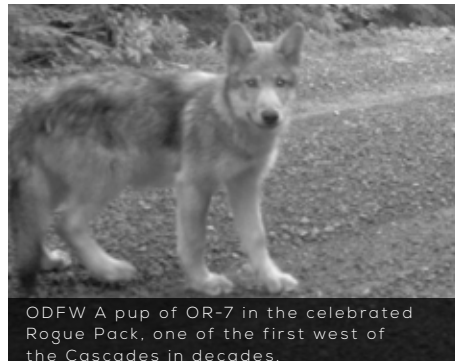
ODFW A pup of OR-7 in the celebrated Rogue Pack, one of the first west of the Cascades in decades.

With your voice and your support, we'll keep fighting for Oregon's wildlife. And we'll keep thinking bigger. ☺