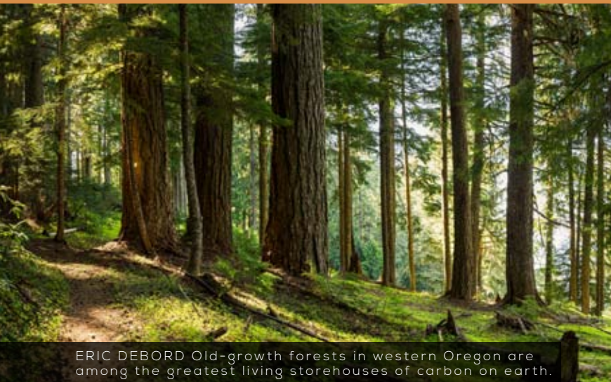
Old-growth forests in western Oregon are among the greatest living storehouses of carbon on earth.