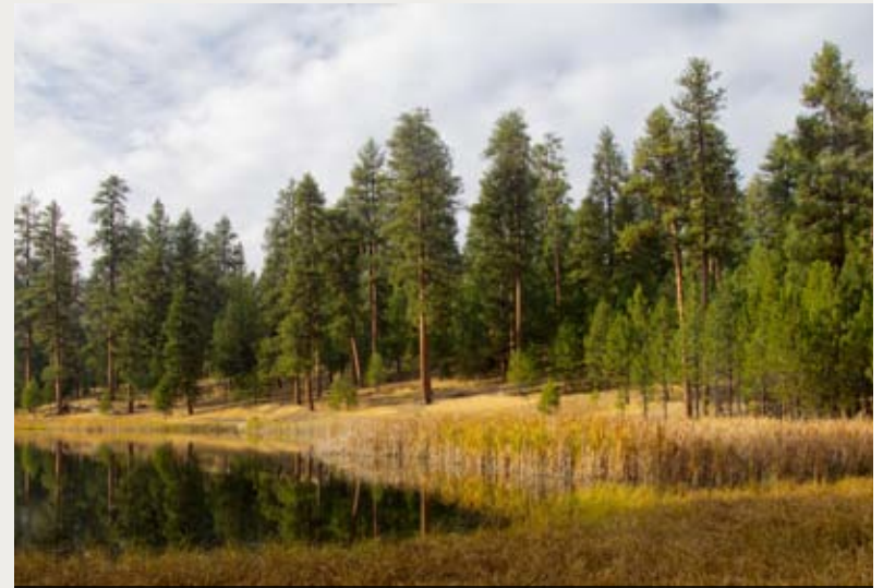
DARLENE ASHLEY Walton Lake - a gathering place for recreation in the Ochoco National Forest.

These threats inspired many to stand up and say no; Crook County public land advocates are ready to fight back. This inspiring new community of activists have banded together to fight to protect the treasure that are the Ochoco Mountains and in support of all public lands across the west. ☺