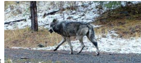
A member of the Chesnimnus Pack wanders past a trail cam.

Soon after, a wolf known as B-45 swam the Snake River, shook herself dry, and became the first known living wolf in Oregon in over half a century. Her visit was short. Panic befell the livestock industry who