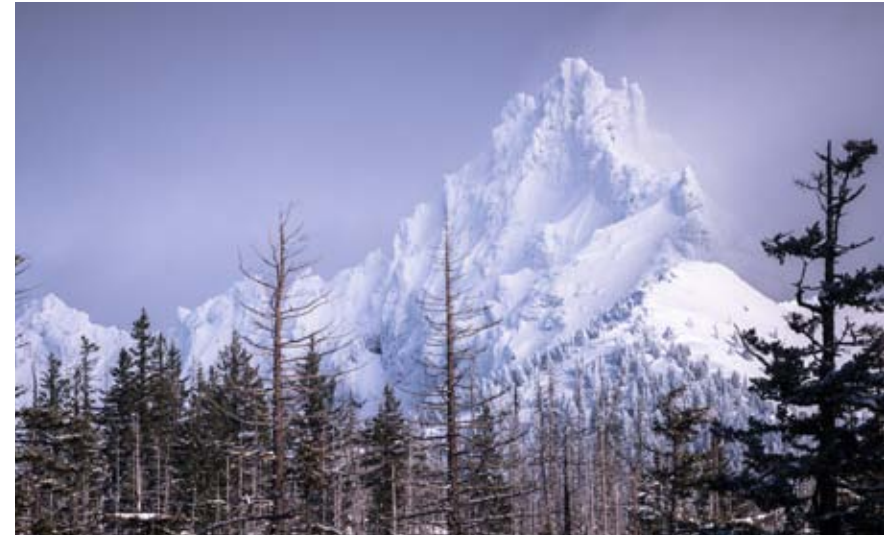
JAMES PARSONS The wildlife and wild places they call home need your help more than ever. Please consider a special year-end gift to keep wolves howling and Oregon wild.

relationship with wolves serves as a bellwether for our ability to share the landscape and not always put our own needs above all else.