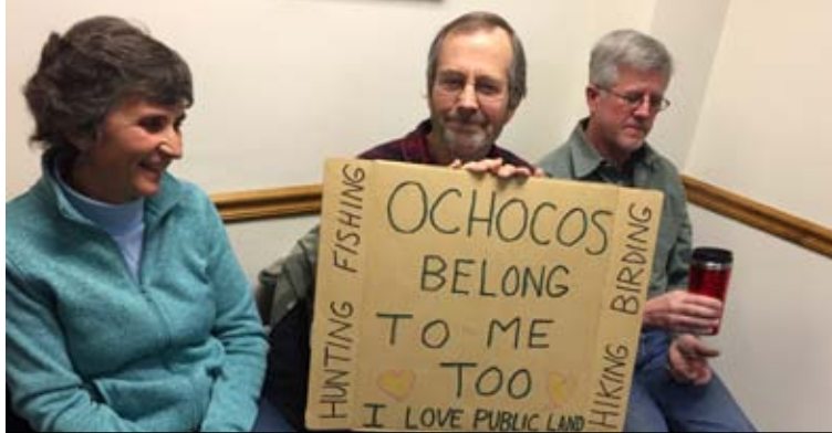
Local advocates are ready to fight back against the anti-public lands agenda.